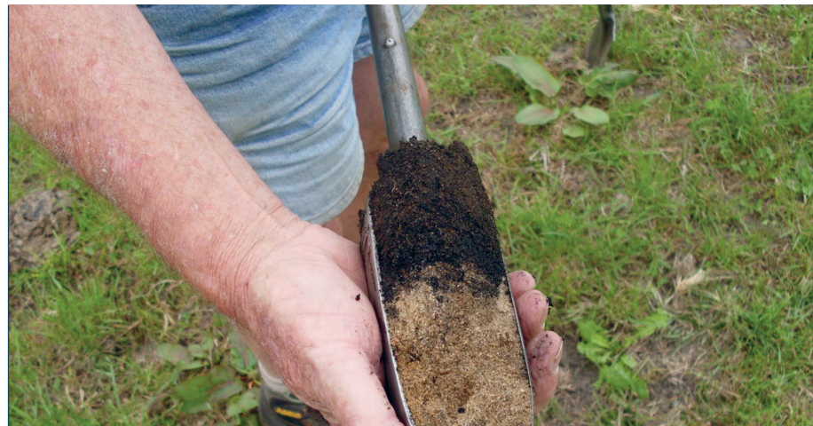
Topsoil is a precious resource primarily due to the high level of organic matter and nutrients it contains relative to subsurface soil.

Adding organic matter to the soil contributes a certain level