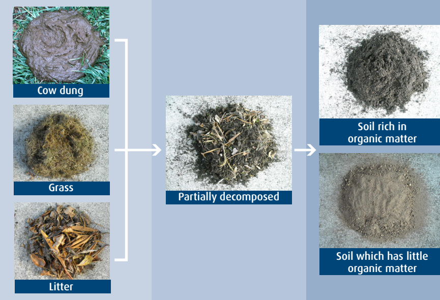
Decomposition of plant residues and animal manure added to the soil produces organic matter that is beneficial to soil health and plant growth