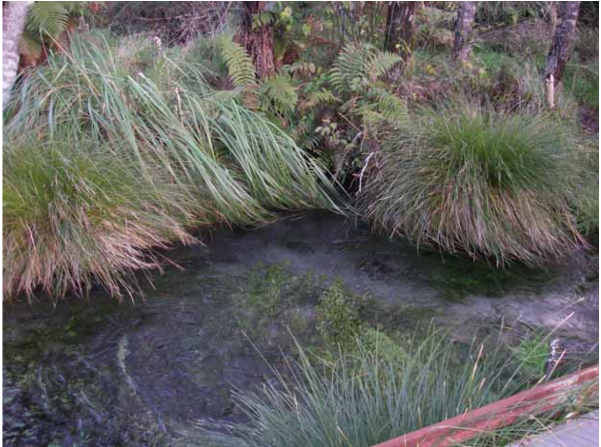
Plate 1. Waipa Stream below the Rotorua District Council water intake, 30 June 2008.

The gully sides include Himalayan honeysuckle ( Leycesteria formosa ), wheki ( Dicksonia squarrosa ), wheki-ponga ( D. fibrosa ), and kiokio ( Blechnum novae-zealandiae ). The stream channel has local patches of Potamogeton chesmanii and Azolla rubra . Channel margins include local purei ( Carex secta ), toetoe ( Cortaderia fulvida ), and Carex geminata .