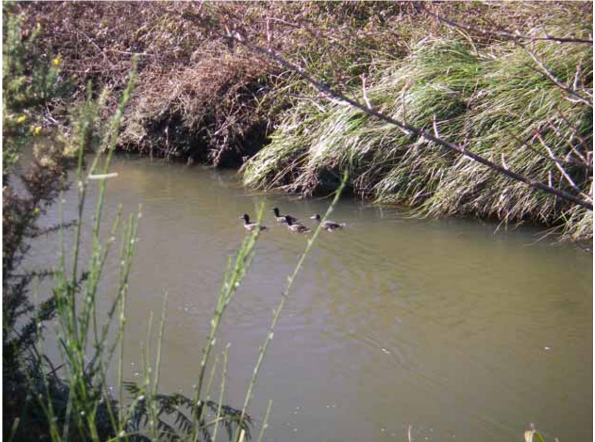
Photo 2. Scaup in the lower Puarenga Stream, 1 July 2008.