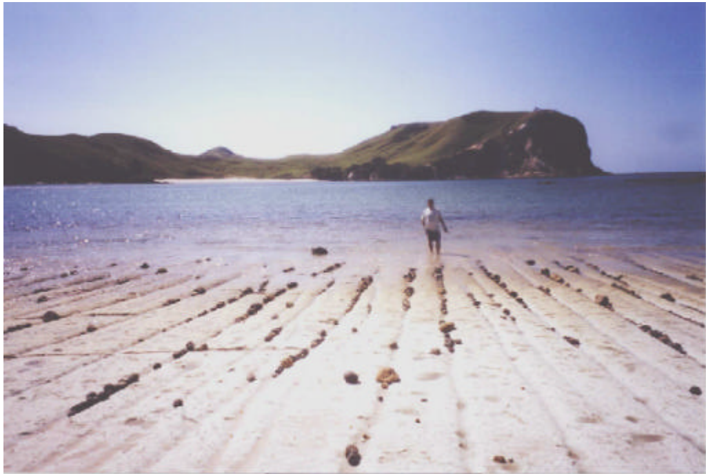
Figure 6: Otama Beach – view looking east. The discontinuous pebble veneer is found at various sites along the beach face of the second dune phase.