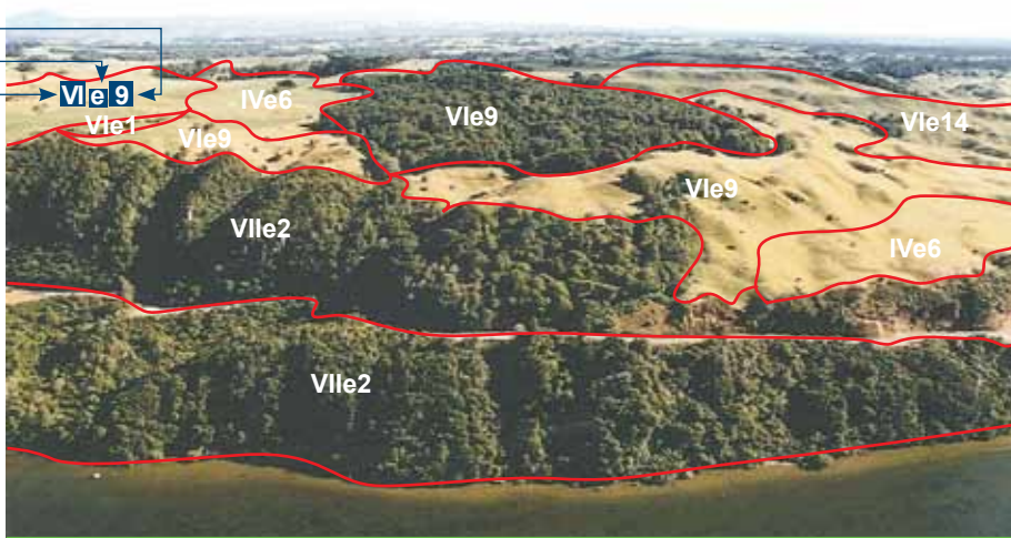
Example of land use capability classification

Each land class can be defined further according to limitations to use and suitable management techniques.