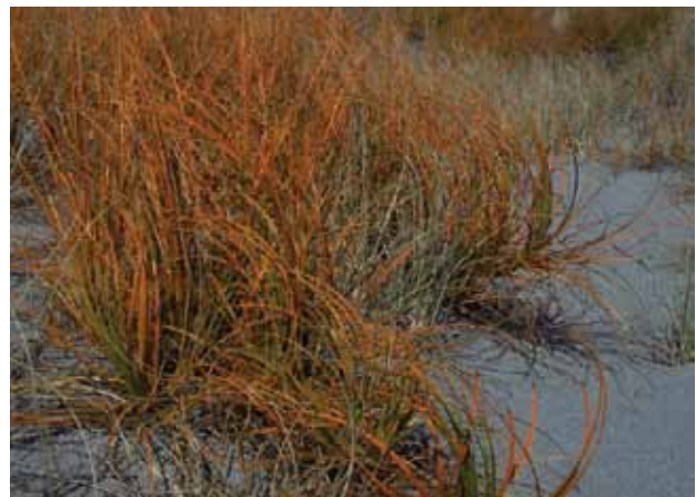
Pīngao at Coastlands – brilliant orange winter colouration

Pīngao is a sand binder and dune builder. Wind-blown sand is trapped amongst its leaves, which accumulates and supplies nutrients to the plant. The stems continue to sprout new shoots as the sand shifts and covers them. The seed heads are conspicuous with their rigid dark spikes which grow above the leaves and bear hundreds of dark brown seeds.