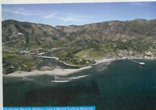
Surfrider Beach, Malibu, now a World Surfing Reserve.

Either way, it's clear that while preserving spots for future generations is universally accepted as good thing, we might have to watch out for exactly how we preserve them.