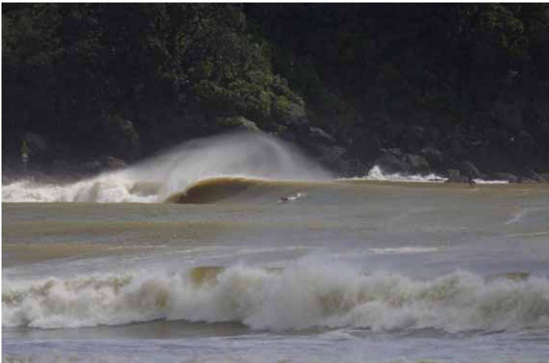
Figure 2 'The Chocolate Bar'.

An example in New Zealand was during a flood event in Whangamata, in January 2011. This event saw waste water infrastructure fail. As a result, raw sewerage was discharged into the mixing zone of a nationally significant surf break, Whangamata Bar. Quality surfing days often coincide with storm events within the wave climate of New Zealand's north-east coast, and there were reports from the event of surfers suffering ill health including inflamed cuts, nausea and conjunctivitis. Below is a shot of the 'Chocolate Bar', as it was affectionately named that day.