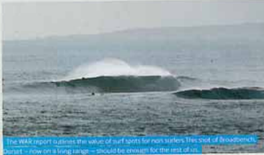
The WAR report outlines the value of surf spots for non-surfers. This shot of Broadbenck, Dorset - row on a living range - should be enough for the rest of us.