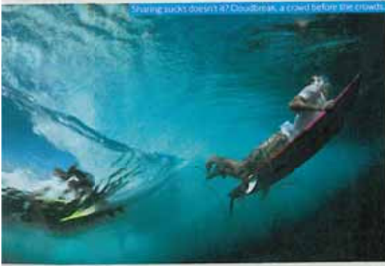
Sharing sucks doesn't it? Cloudbreak, a crowd before the crowds.