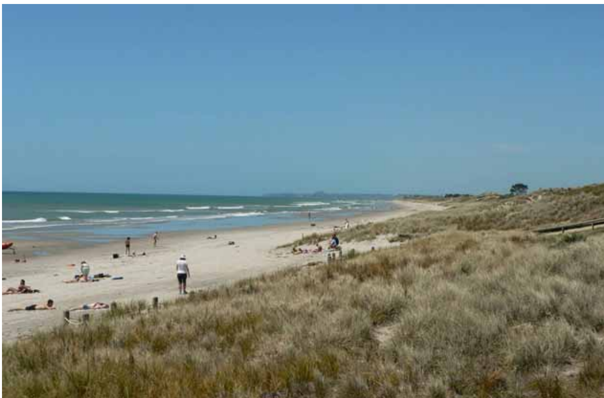
Figure 1 Papamoa Beach