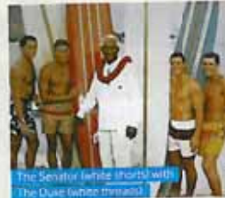
The Senator (left) sports with The Duke (right) reveals.

SOS and others objected to the inclusion of the words "competitive surfing" in the bill, for instance that the bill is for: "The promotion of the long-term preservation of Hawaii surfing for recreation and competitive surfing." According to opponents, the enshrinement of these areas specifically for competitive surfing would set up a conflict between the average recreational surfer and commercial