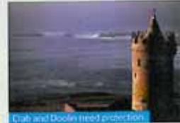
Crab and Doolin need protection.

You can find out more and help support the surfers of Clare by signing the petition online at TSP's website or at http://www.petitiononline.com/Doolin10/petition.html